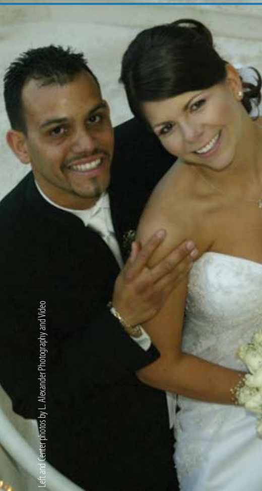
Left